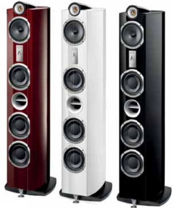
SIGNATURE - ALPHA

Every product from the Signature range is available in 3 finishes: A mahogany varnish finish, a black lacquered piano finish or a white lacquered piano finish.