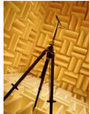
Anechoic chamber developed for high end products

“ This luxury craftsmanship combines the highest level cabinetwork with TRIANGLE's acoustic expertise. ”