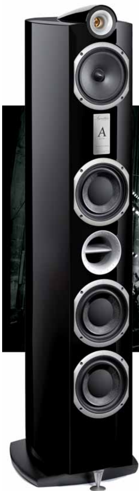
SIGNATURE - DELTA