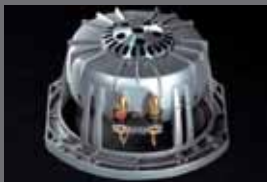
A few steps in the driver assembly process.